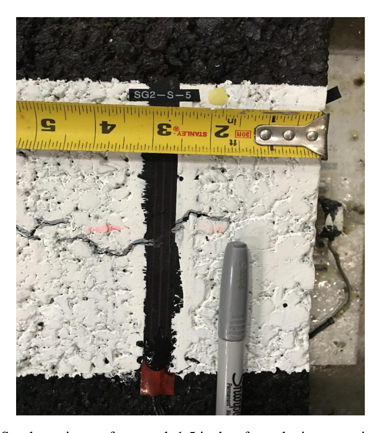
Fig 7 South section surface crack 1.5 inches from the inner vertical edge