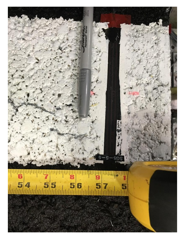
Fig 8 South section surface crack 3.5 inches from the outer vertical edge