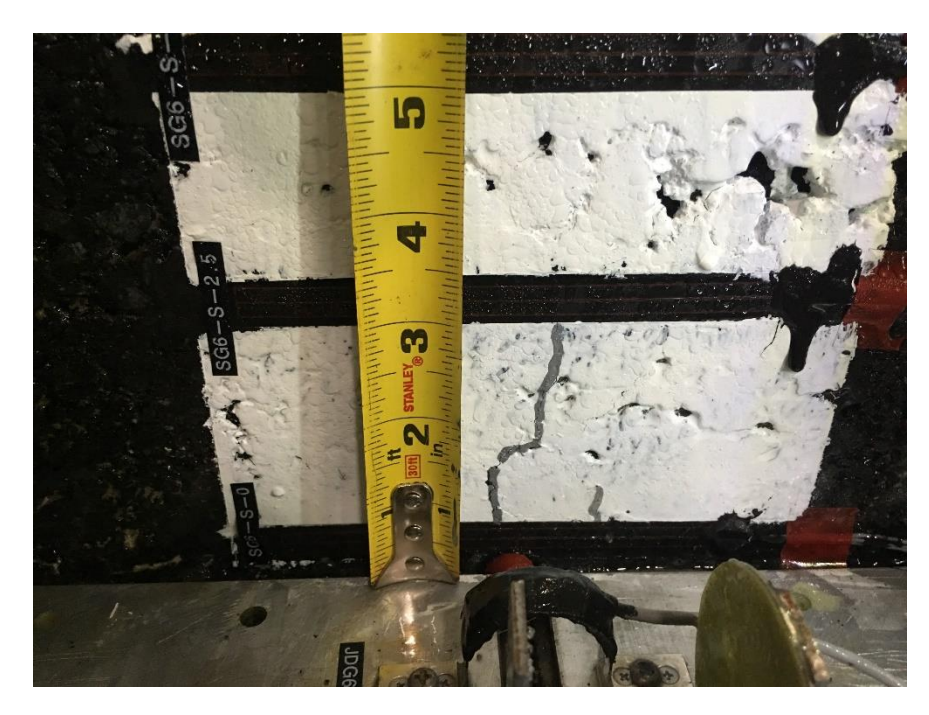
Fig 6 Bottom-up crack at SG6-S-0 3 inch long