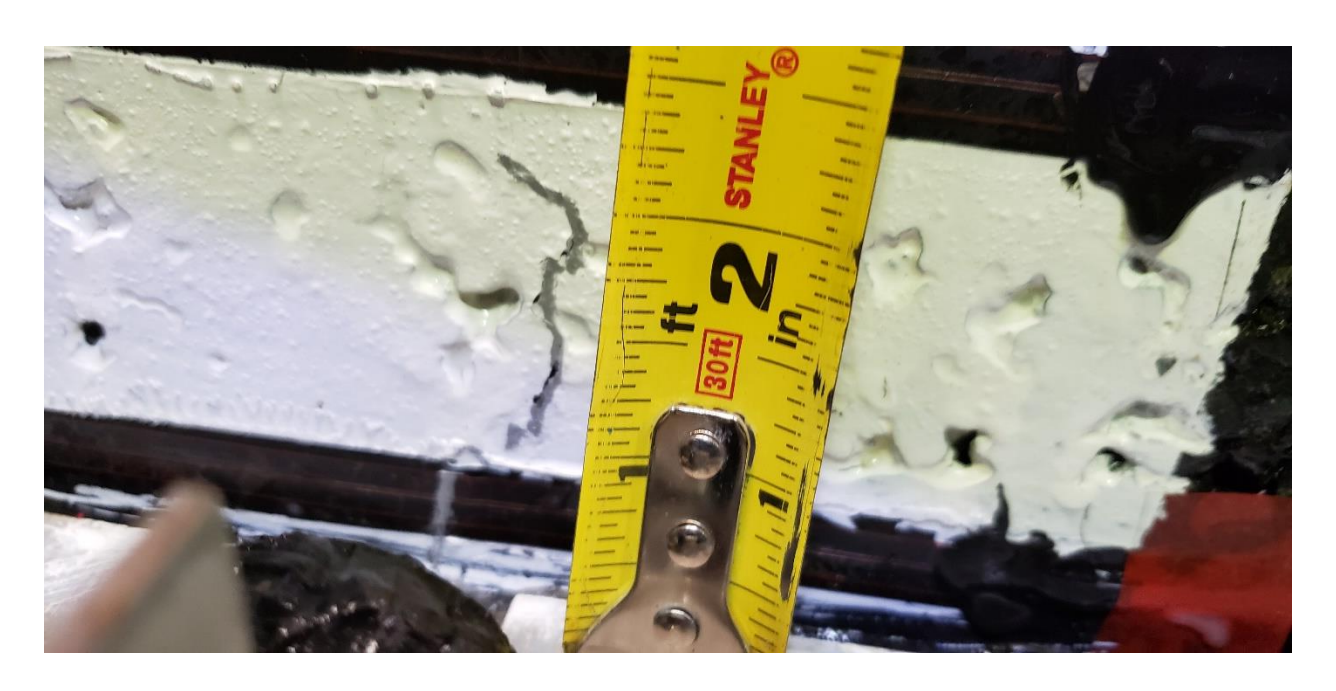
Fig 2 Bottom-up crack at SG6-N-0