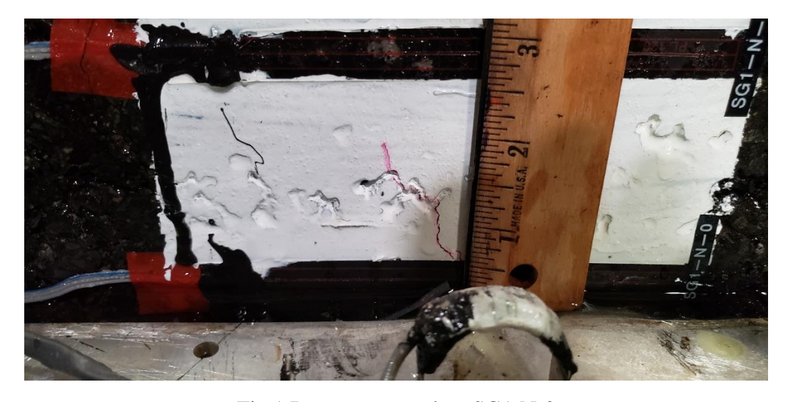
Fig 1 Bottom-up crack at SG1-N-0