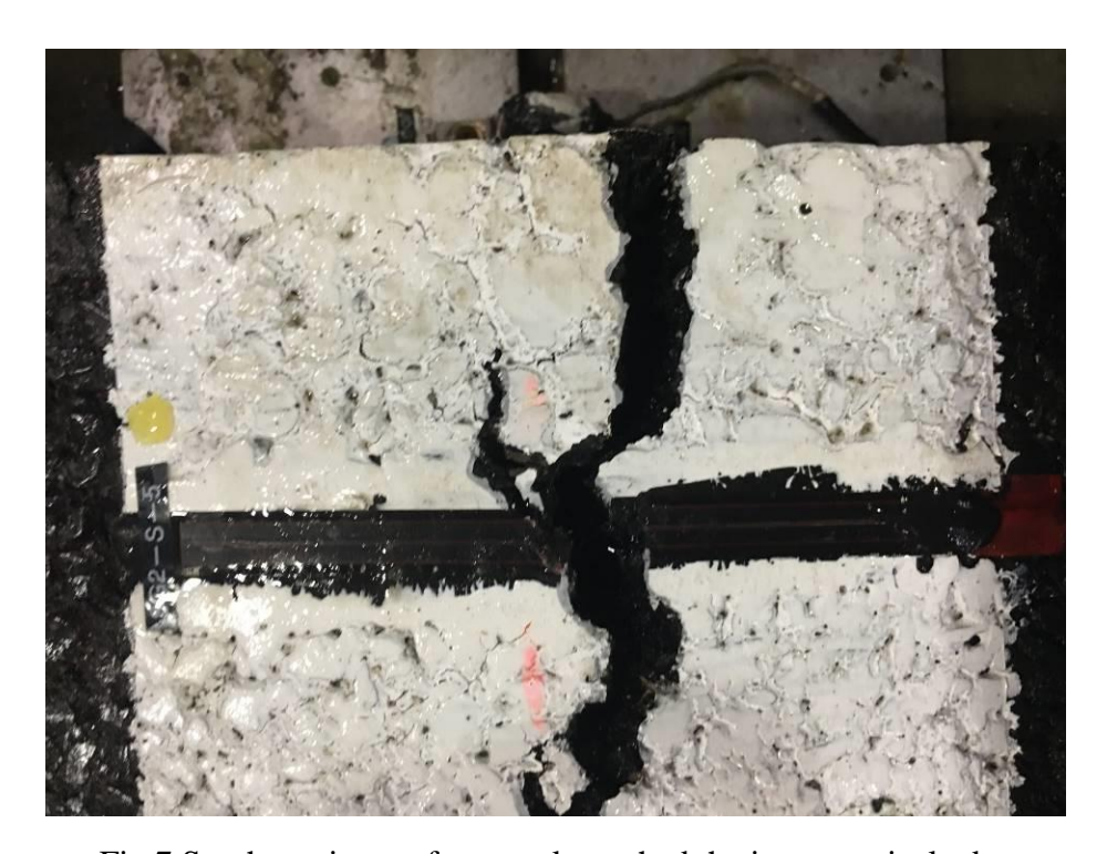
Fig 7 South section surface crack reached the inner vertical edge