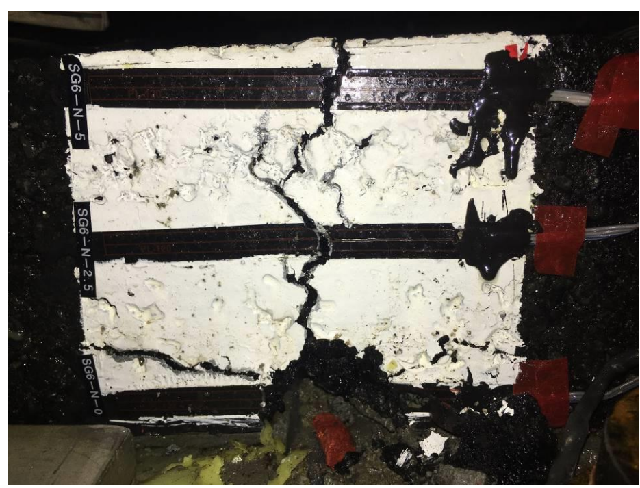
Fig 2 Bottom-up crack at north section outer edge reached top surface