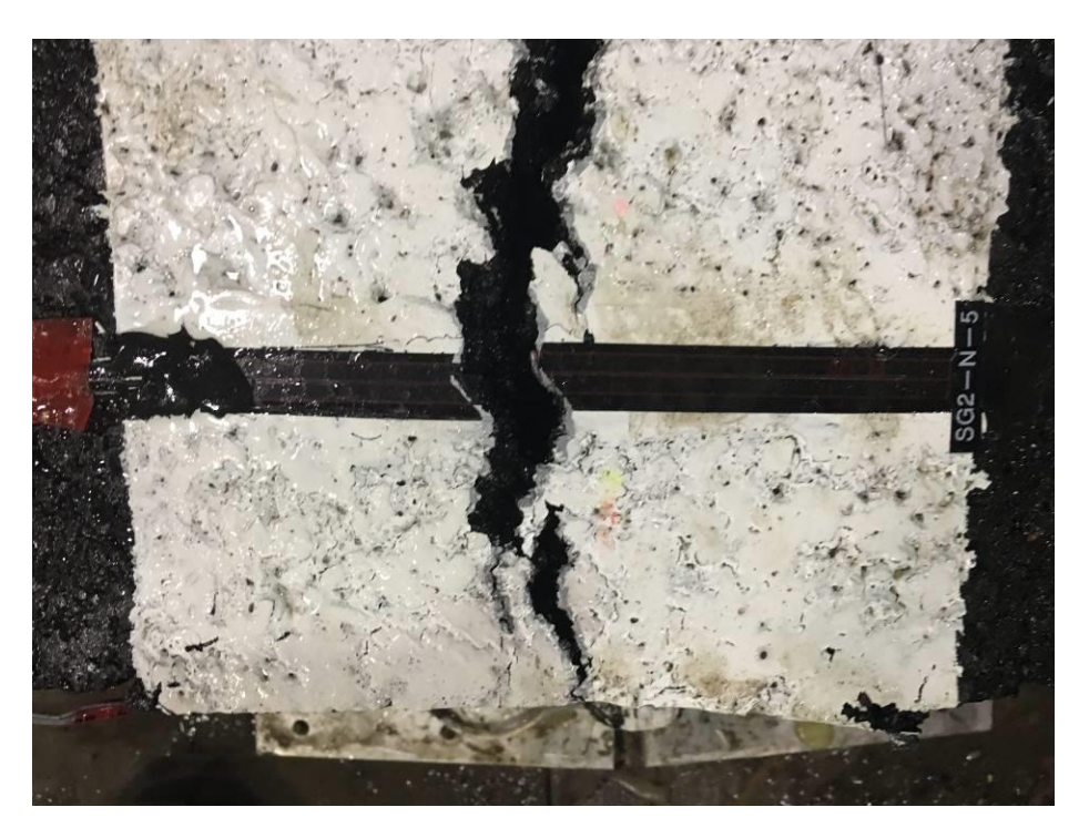
Fig 4 North section surface crack reached inner vertical edge