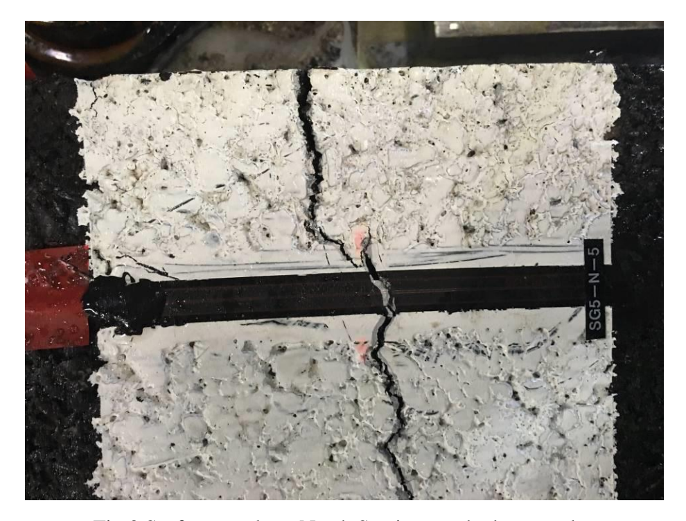
Fig 3 Surface crack on North Section reached outer edge