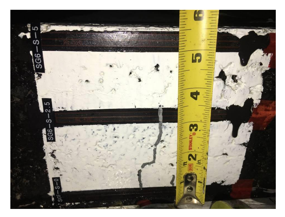
Fig 6 Bottom-up crack at SG6-S-0, SG6-S-2.5 approximately 3.5 inch long