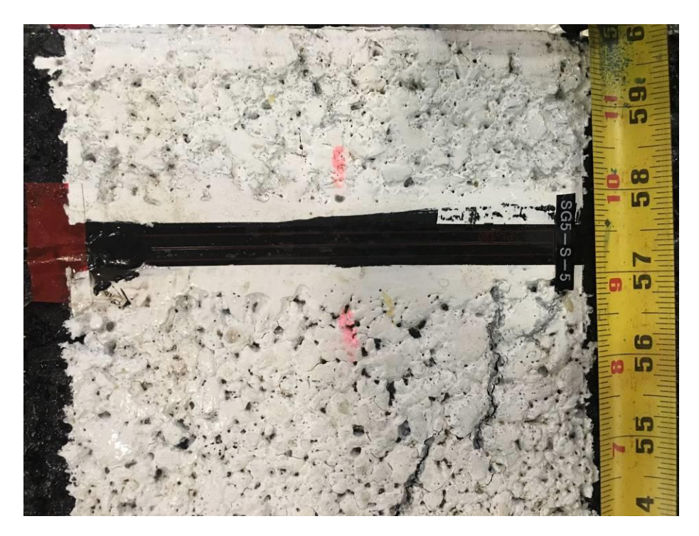
Fig 8 South section surface crack 3 inches from the outer vertical edge