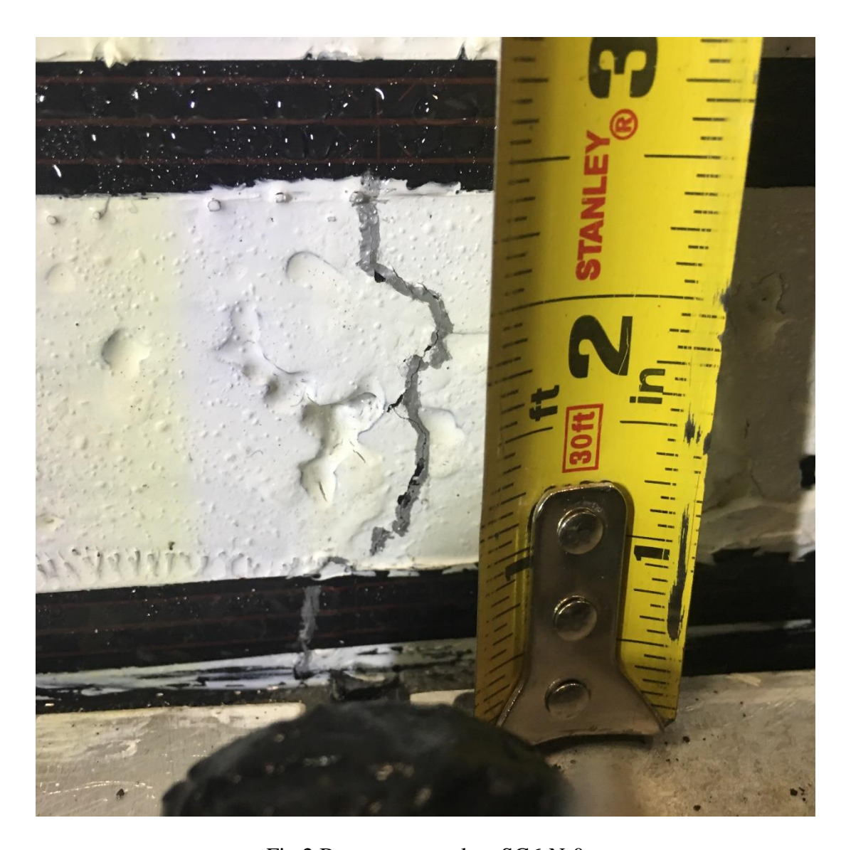
Fig 2 Bottom-up crack at SG6-N-0