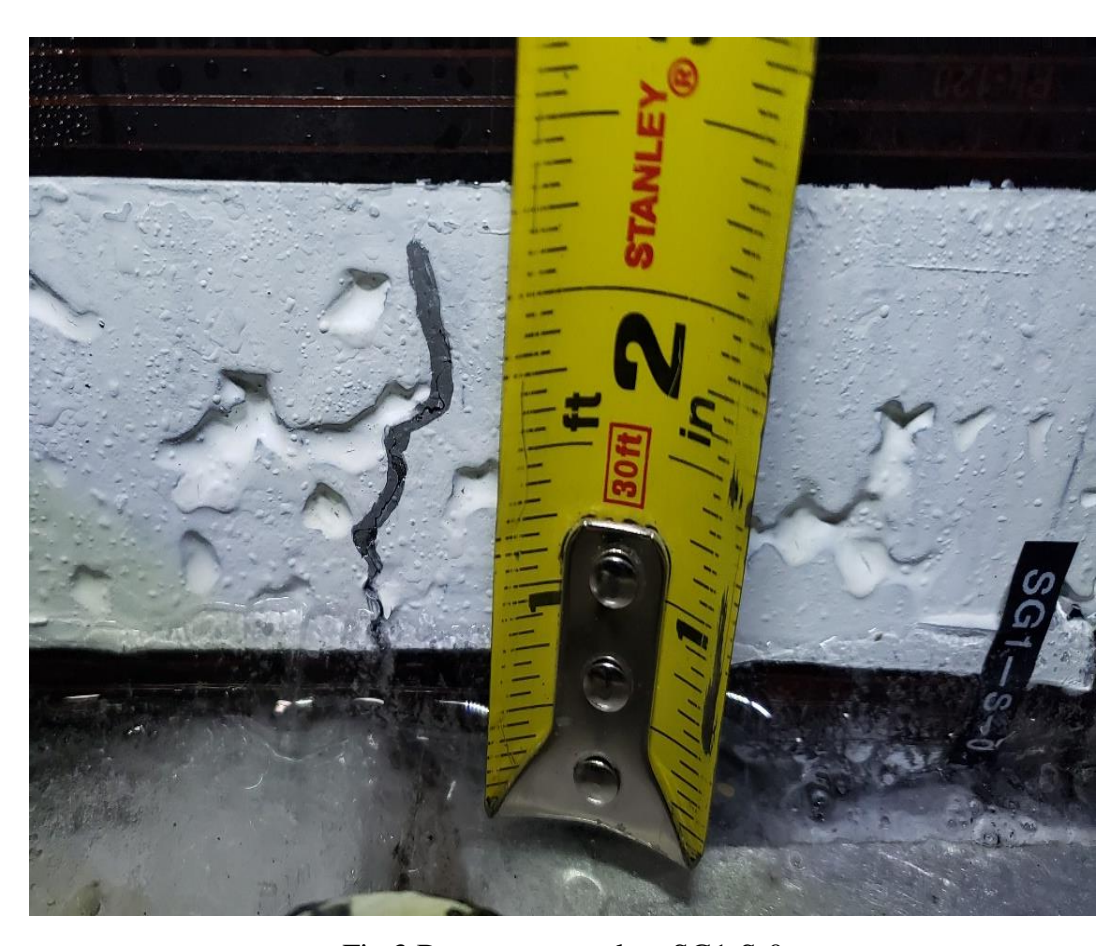
Fig 3 Bottom-up crack at SG1-S-0