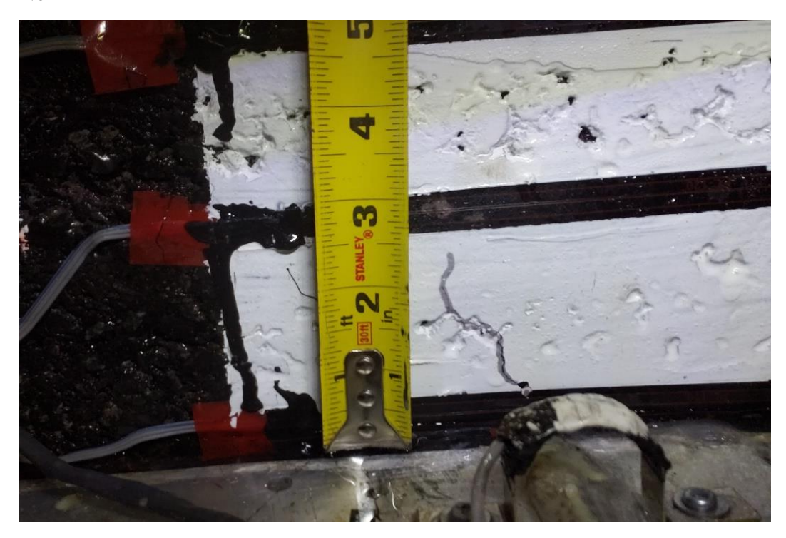
Fig 1 Bottom-up crack at SG1-N-0