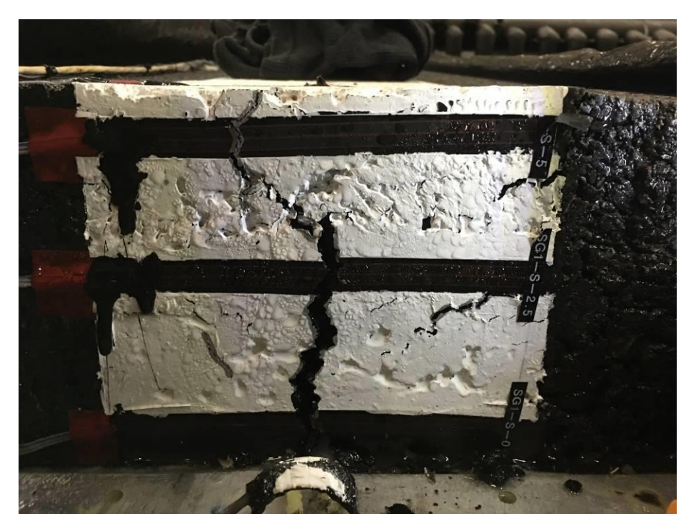
Fig 5 Bottom-up crack at inner vertical edge of south section reached top surface