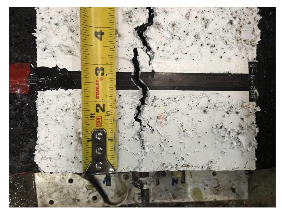
Fig 4 North section surface crack 0.5 inch from the inner vertical edge