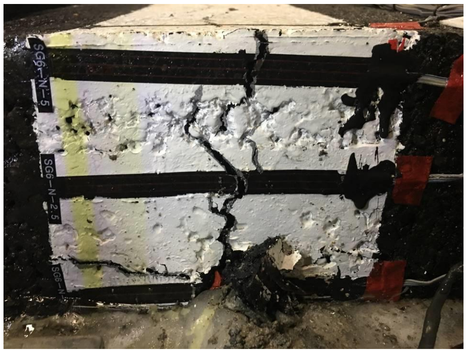
Fig 2 Bottom-up crack north outer edge reached top surface