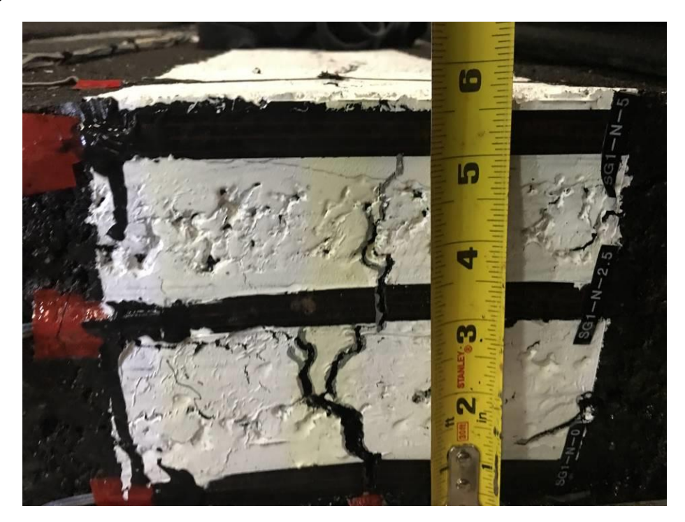
Fig 1 Bottom-up crack at SG1-N-0 and SG1-N-2.5 5 inch long