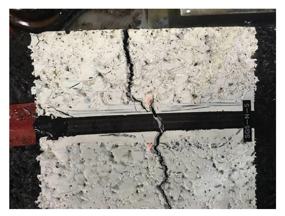
Fig 3 Surface crack on North Section reached outer edge