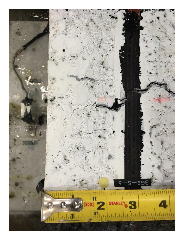
Fig 7 South section surface crack 1 inches from the inner vertical edge