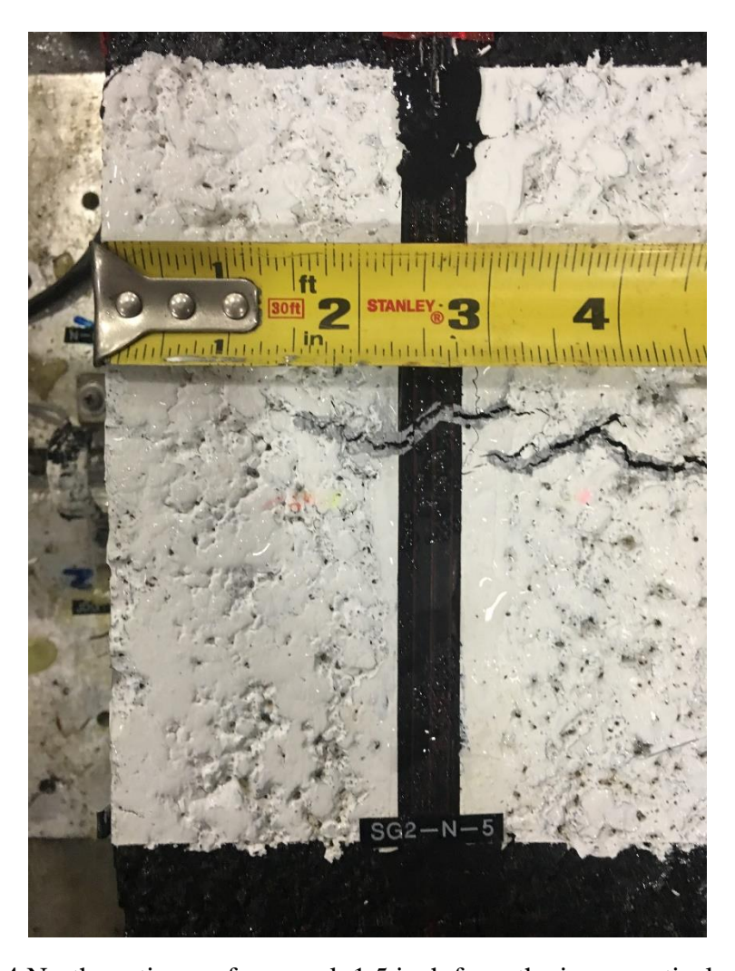
Fig 4 North section surface crack 1.5 inch from the inner vertical edge