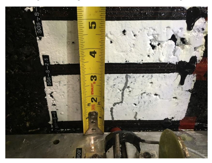
Fig 6 Bottom-up crack at SG6-S-0 3 inch long