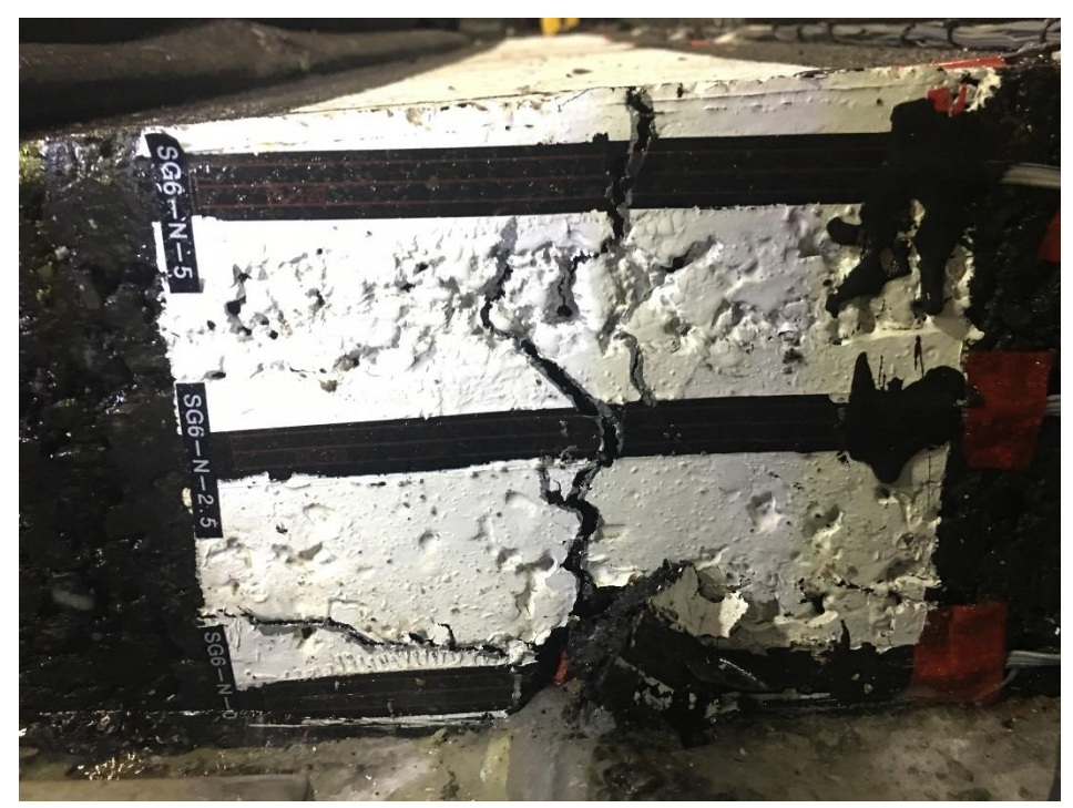
Fig 2 Bottom-up crack north outer edge reached top surface