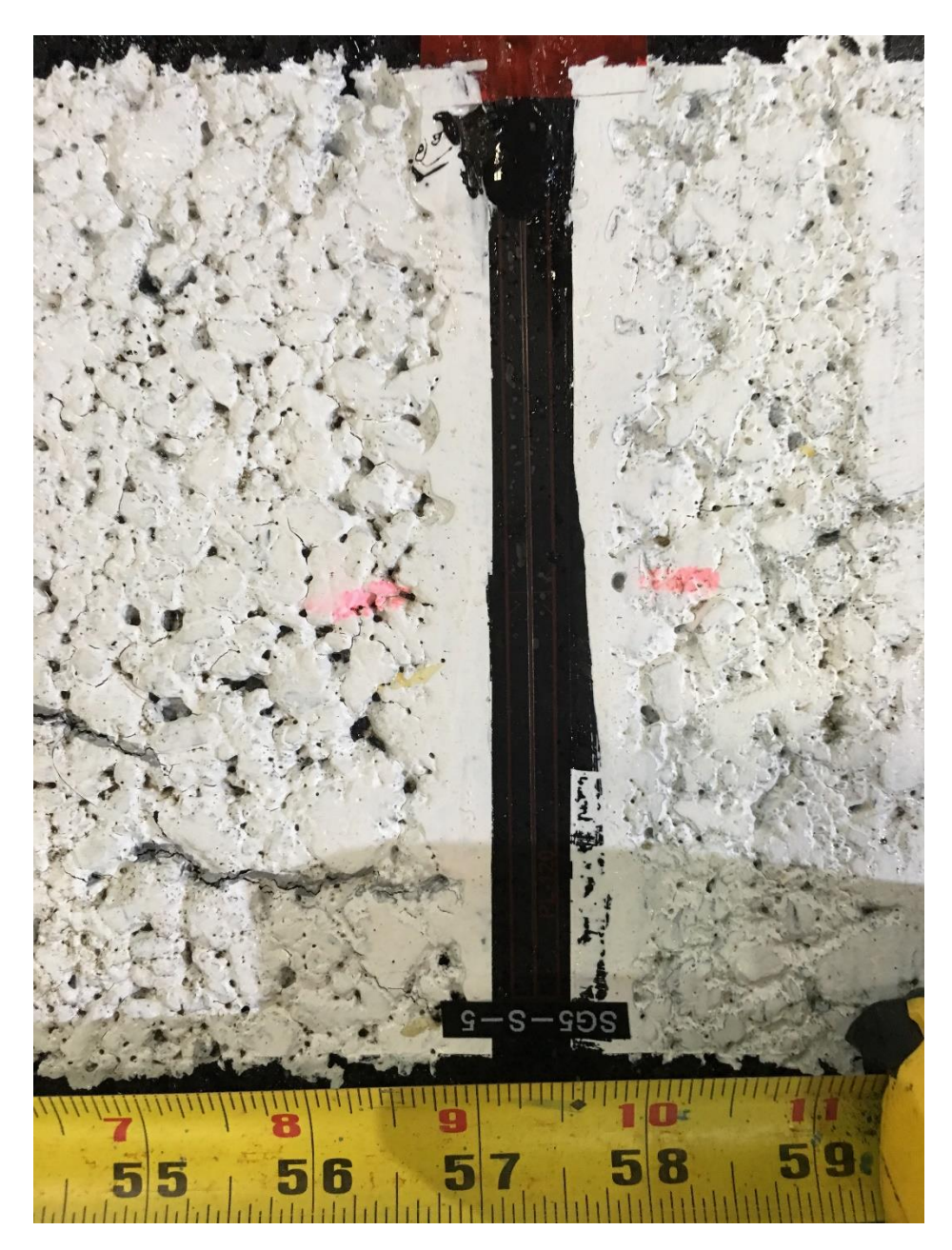
Fig 8 South section surface crack 3 inches from the outer vertical edge