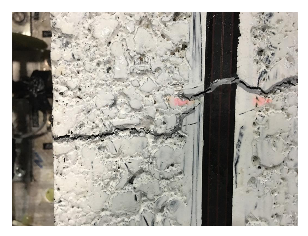
Fig 3 Surface crack on North Section reached outer edge