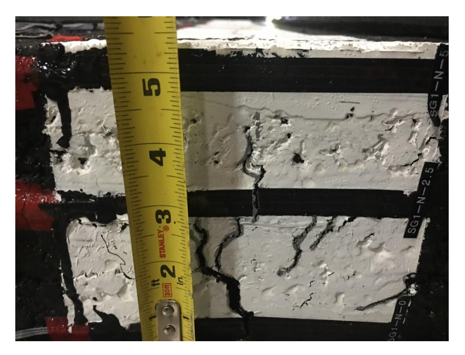
Fig 1 Bottom-up crack at SG1-N-0 and SG1-N-2.5 4.5 inch long