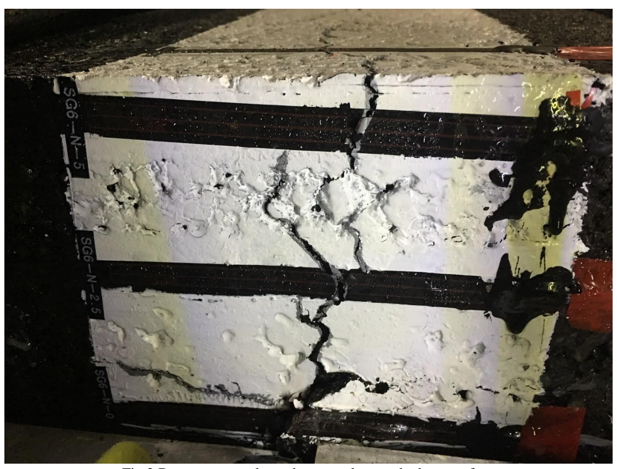
Fig 2 Bottom-up crack north outer edge reached top surface