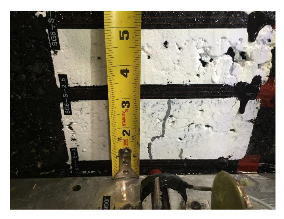
Fig 5 Bottom-up crack at SG6-S-0 3 inch long