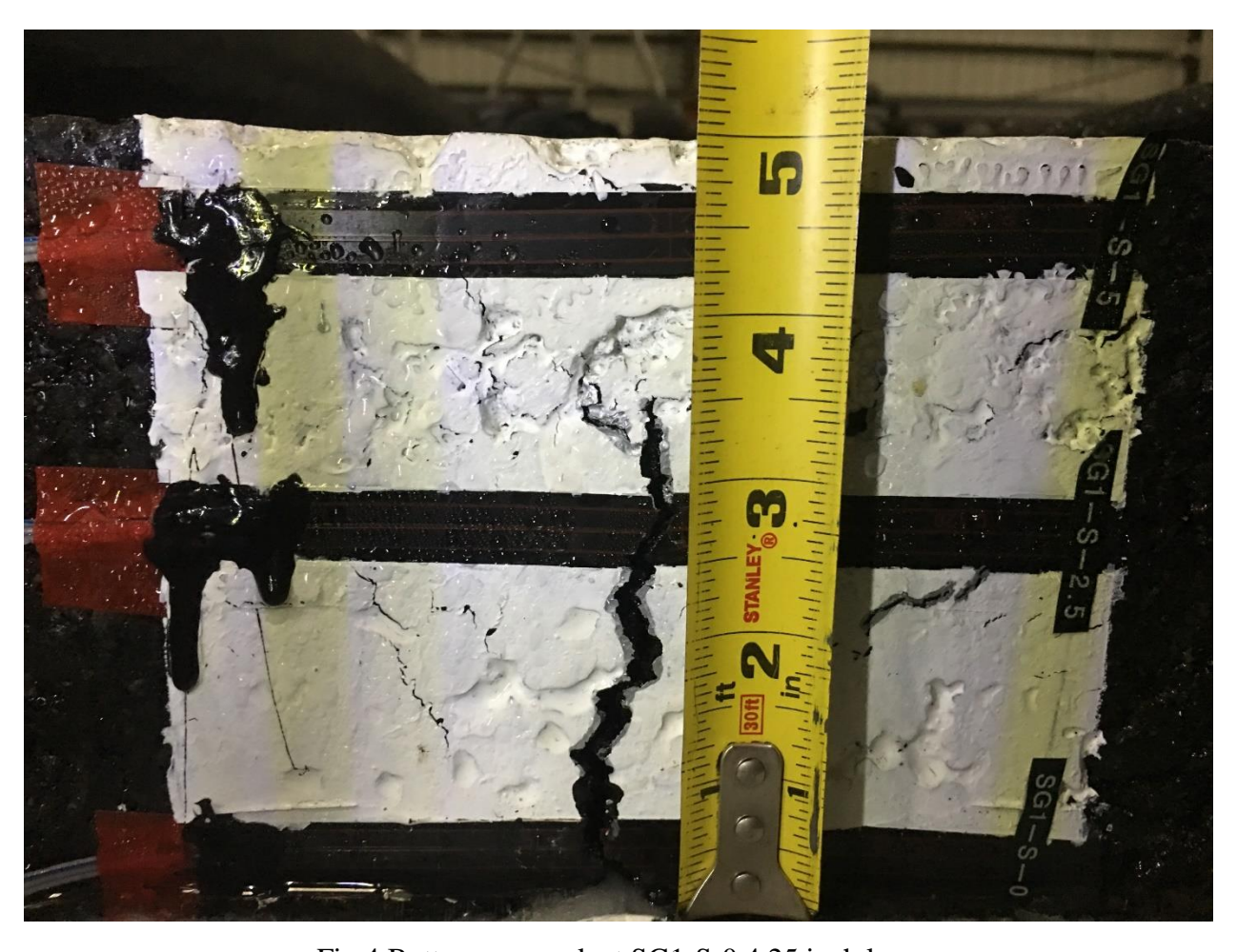
Fig 4 Bottom-up crack at SG1-S-0 4.25 inch long