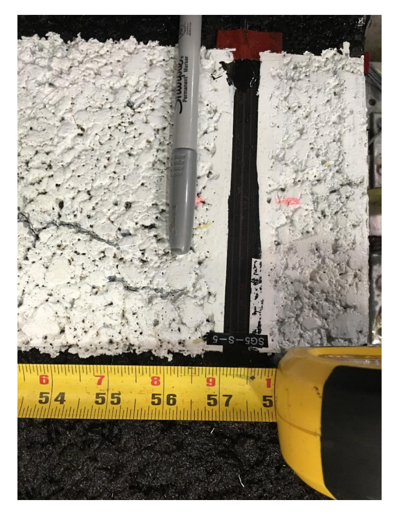
Fig 7 South section surface crack 3.5 inches from the outer vertical edge