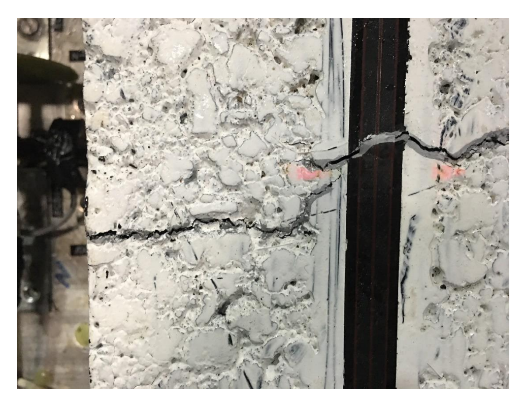
Fig 3 Surface crack on North Section reached outer edge