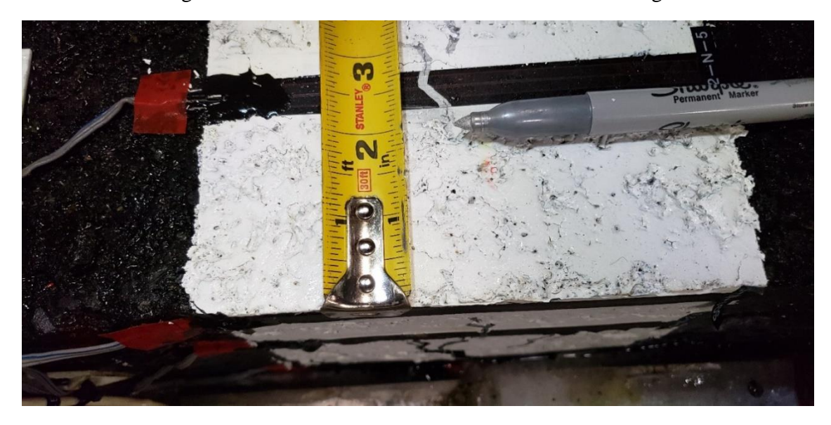
Fig 4 North section surface crack 2 inch from the inner vertical edge