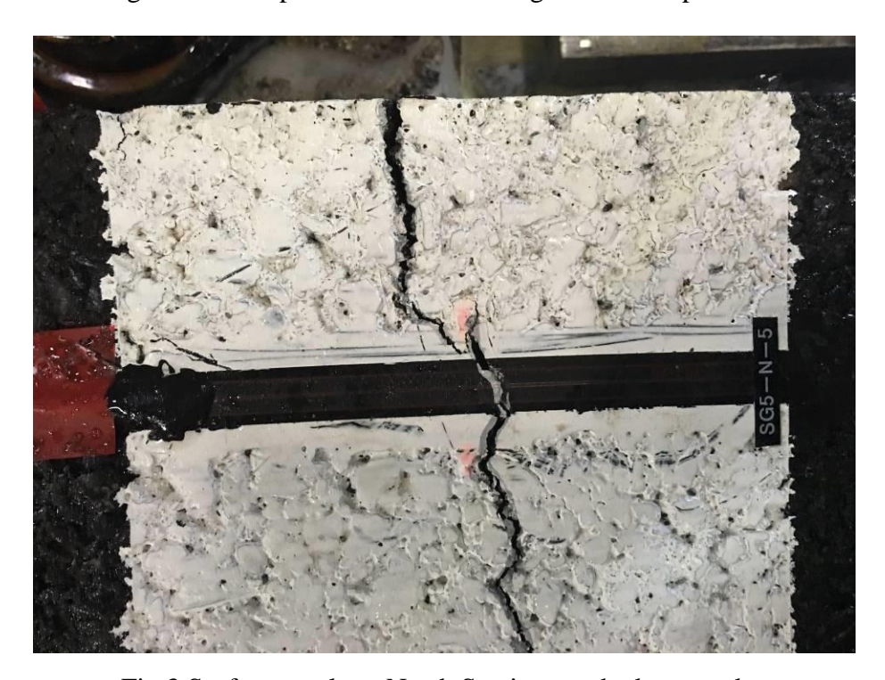
Fig 3 Surface crack on North Section reached outer edge