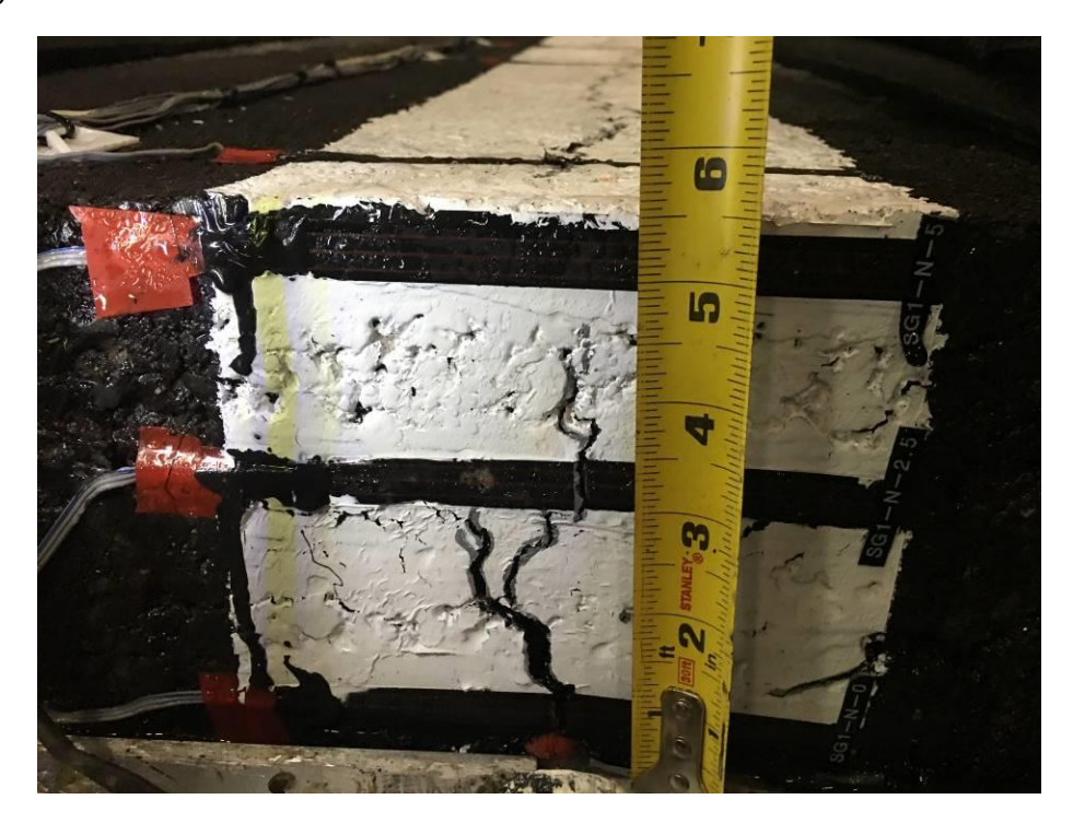
Fig 1 Bottom-up crack at SG1-N-0 and SG1-N-2.5 4.5 inch long