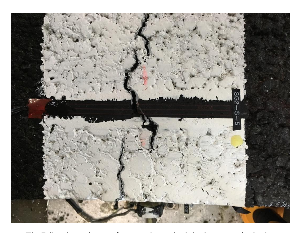
Fig 7 South section surface crack reached the inner vertical edge