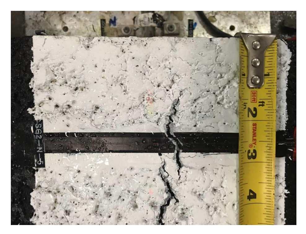
Fig 4 North section surface crack 1.5 inch from the inner vertical edge