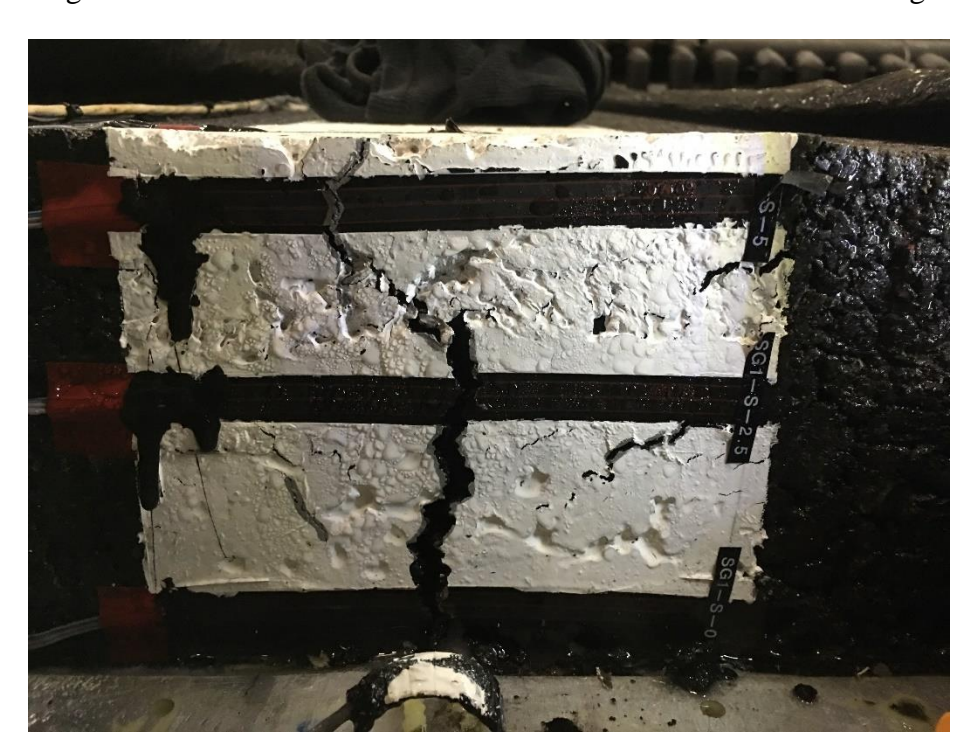
Fig 5 Bottom-up crack at SG1-S-0 reached top surface