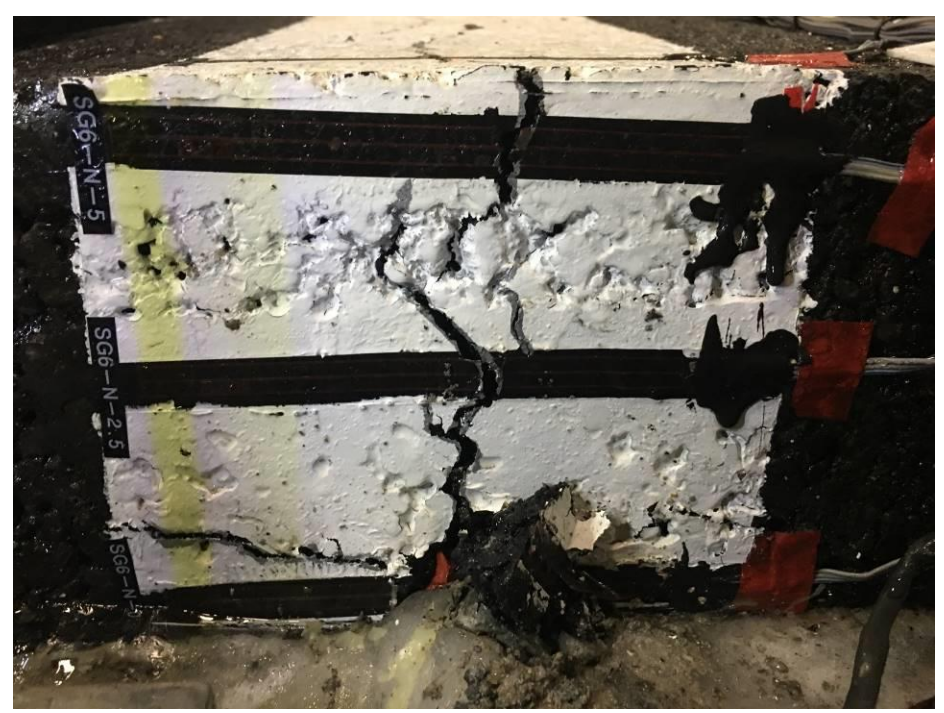
Fig 2 Bottom-up crack north outer edge reached top surface