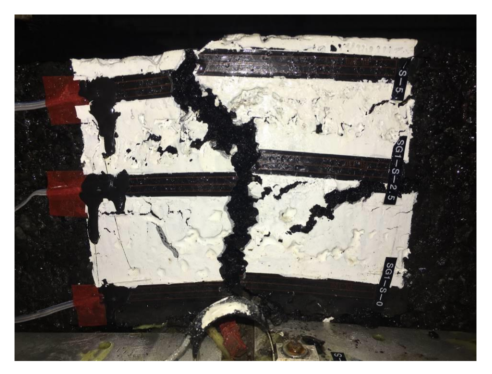
Fig 5 Bottom-up crack at inner vertical edge of south section reached top surface