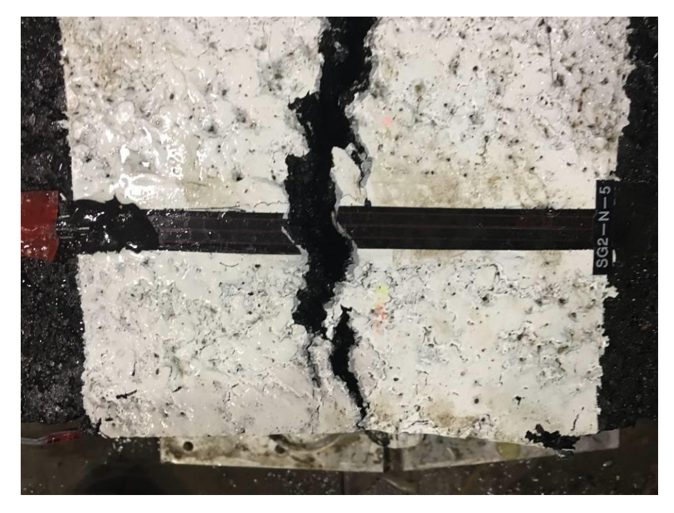
Fig 4 North section surface crack reached inner vertical edge