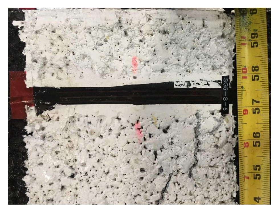
Fig 8 South section surface crack 3 inches from the outer vertical edge