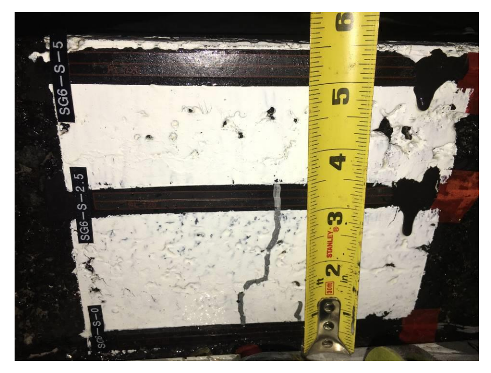
Fig 6 Bottom-up crack at SG6-S-0, SG6-S-2.5 approximately 3.5 inch long