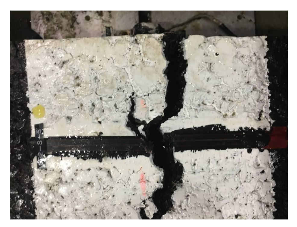
Fig 7 South section surface crack reached the inner vertical edge