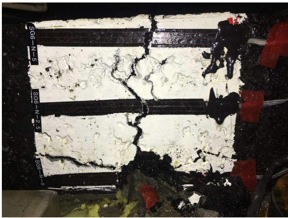
Fig 2 Bottom-up crack at north section outer edge reached top surface

Fig 1 Bottom-up crack at north section inner vertical edge reached top surface